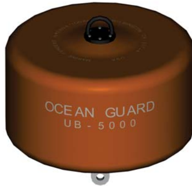
Custom end fitting available